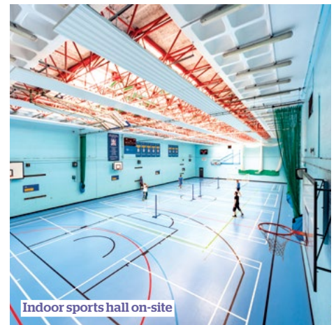
Indoor sports hall on-site